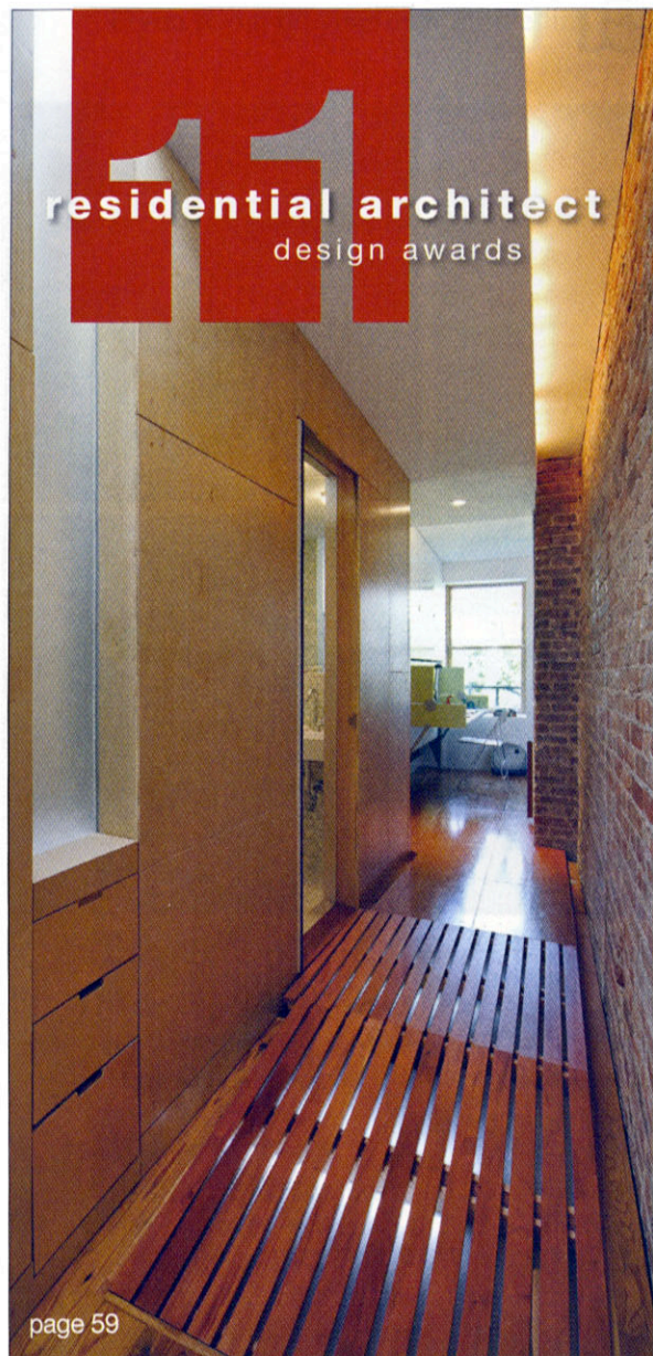
The raised deck in noroof architects' Finger | Kennedy Apartment, which won a Merit award in our Renovation category, allows for under-floor storage and helps reduce clutter.